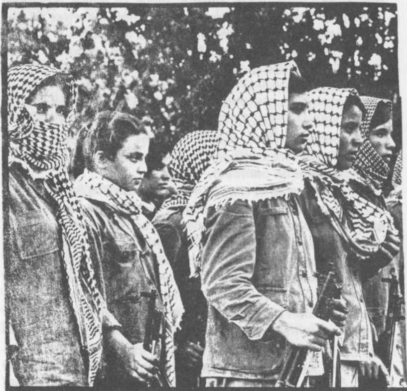
Palestinian Women's Militia Jordan, July 1970

On the other hand, we criticize sisters for being passive and docile. We want women to become leaders, to speak out in public, to stop being shy and timid, to learn to be strong. We tell sisters to change, the way our mothers have taught us to be, the way our mothers' mothers' have always been. And again, we did not completely understand why our sisters had difficulty in understanding what passivity is, and how to change. Sisters still volunteered to cook and sew, to take care of children. Sisters still felt more comfortable letting the men