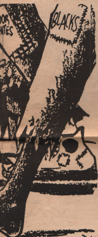
Is That They're Getting Into Step?

ived little attention as yet is the poseast Asia. The discovery of potentially , off the tip of South Vietnam and under the question of Japan's role sharply intolized nation, imports 85% of her oil from ily increased cost of oil from this source, Japanese industrialists are also faced with 1960, to more than ten million barrels per and expression in the revival of the reacte drive by Sato's government to expand the ill of East Asia. This question needs urgent as an option to sections of the American orces, U.S. rulers could keep their fingers e same time being able to withdraw Ameri- ation" of the war.