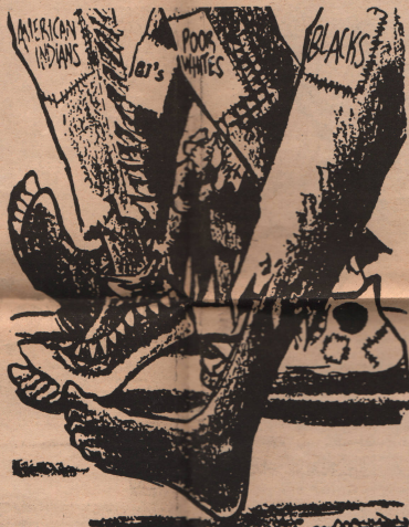
'What Worries Me, Senator, Is That They're Getting Into Step'

Another important issue which has received little attention as yet is the possibility of Japanese involvement in Southeast Asia. The discovery of potentially huge oil reserves under Indonesian waters, off the tip of South Vietnam and under the coastal shelf of China has brought the question of Japan's role sharply into focus. Japan, Asia's most highly industrialized nation, imports 85% of her oil from the Middle East. Unhappy about the recently increased cost of oil from this source, and the rising costs of transportation, Japanese industrialists are also faced with a projected tripling of consumption by 1980, to more than ten million barrels per day. This incentive to aggression has found expression in the revival of the reactionary militarist "bushido" spirit and the drive by Sato's government to expand the role of the "Self-Defence Forces" into all of East Asia. This question needs urgent attention because of its attractiveness as an option to sections of the American ruling class. By allying with Japanese forces, U.S. rulers could keep their fingers firmly implanted in Indochina while at the same time being able to withdraw American troops. This would mean real "Asianization" of the war.