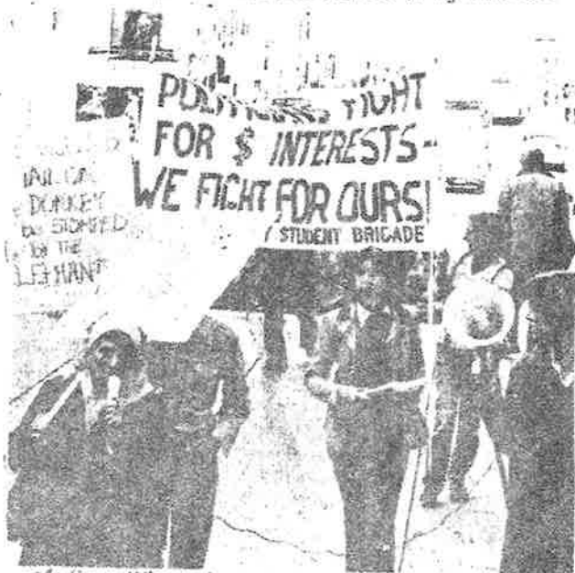
Madison, Wisconsin RSB pickets Mondale's during his recent visit.

This year there's another choice beside the usual pick between the "lesser of two evils." The Unemployed Workers Organizing Committee (UWOC), a national organization of the unemployed, is calling for demonstrations the evening of November 2, election day, under the slogan Politicians Fight for $$ Interests—We Must Fight for Our Own! UWOC is calling on the ten million unemployed in this country and on the rest of us to refuse to fall in behind either party or candidate and to start building our strength to fight in our own interests. The demonstrations on November 2 are a way to say No! to the plans both parties have for our future and to hit at their attempts to restore our faith in their rotten system. On November 2 we'll be especially raising the demand for Jobs or Income! and talking about all the abuses people face that we have to fight against.