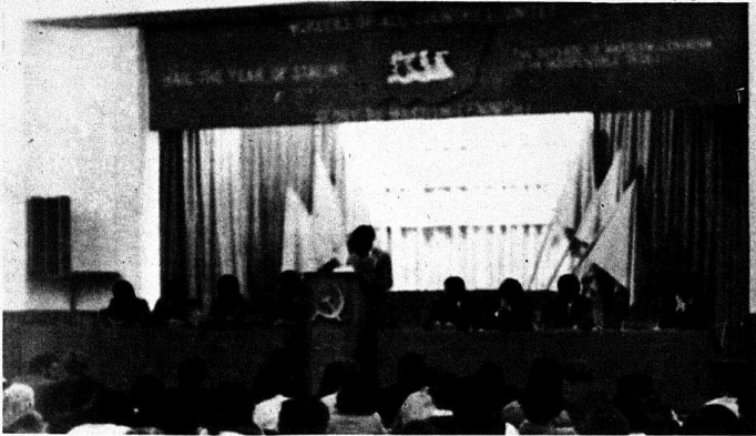
Photo shows the representative of the Revolutionary Communist Party of Chile at the rostrum delivering his speech.