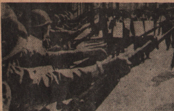
Army tries to intimidate Memphis strikers