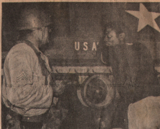
Army vs. black workers in Detroit, 1967

The U.S. bosses also use their Army abroad to guard their profits. They build thousands of factories all over the world