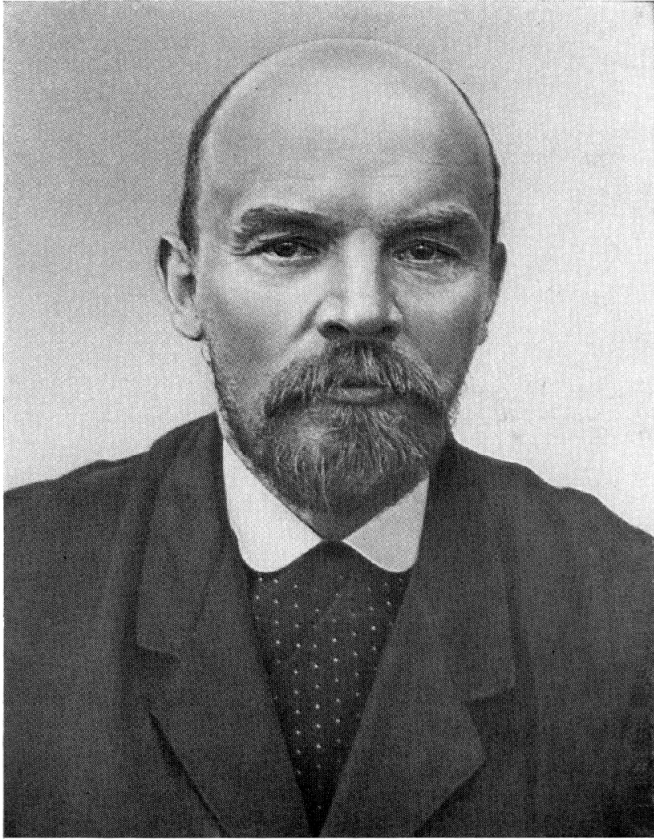
V. I. Lenin 1914