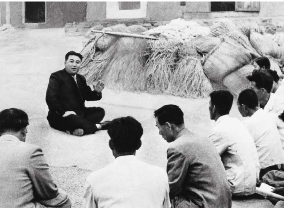
Kim Il Sung talking with the farmers at Chongsan-ri, Kangso County (October 1958)