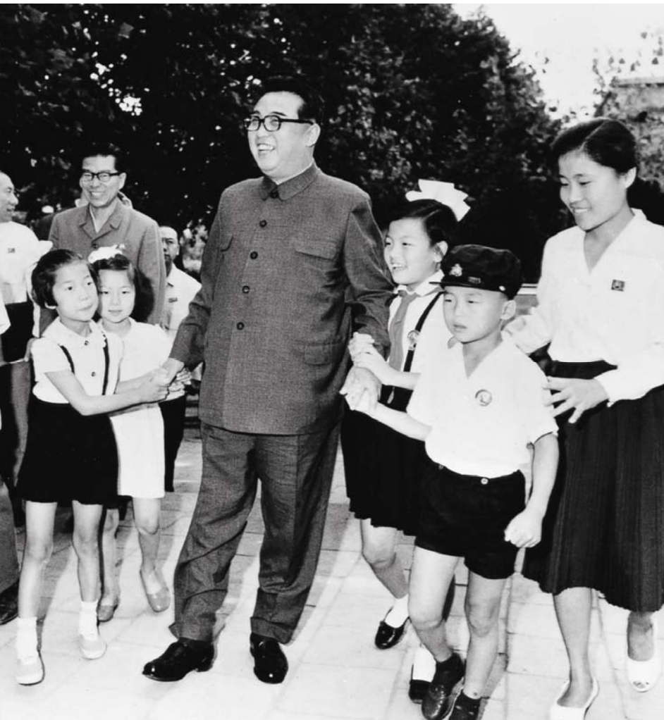
Kim Il Sung on a visit to the Taedongmun Primary School on the day of the start of a new school year (September 1972)