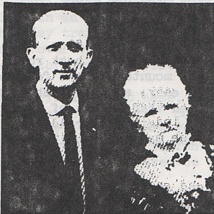
Steel Strike — 1919. Foster and Mother Jones.

Then, a couple of weeks later, something interesting happened. President Wilson suddenly called upon our national steel committee by telegram and through the press to postpone the strike, which was set for September 22nd, until his scheduled national industrial conference should take place in October. This conference turned out to be a rabidly open shop affair and it would have been utterly futile for us to rely upon it for consideration. We foresaw this and refused to delay the strike. But the President's telegraphed demand for a postponement was highly demoralizing to our movement. Thus President Wilson, who refused to openly ask Judge Gary to sit down with his workers to put an end to the 12-hour day, 7-day week and the other inhuman conditions prevailing in the steel industry, did not hesitate to send us publicly an impossible demand that almost broke the steel workers' ranks. Nor did he seem to fear any loss of prestige through our refusal.