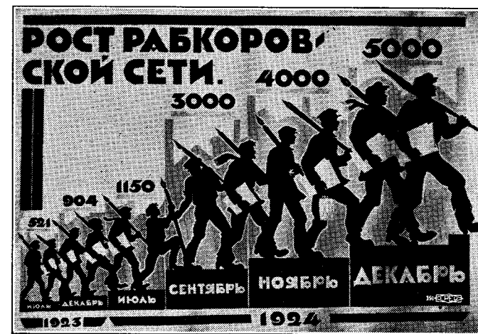
GROWTH OF RABKOR SYSTEM FROM JUNE, 1923, TO DECEMBER, 1924

The editors of the Gudok , like the leaders of the Russian Party in general, are keenly aware of the tremendous importance of the "Rabkor" system and they spare no effort to develop it. In January of this year the Gudok held a national convention of its "Rabkors". There were 321 delegates. They came from the "Rabkor" committees, which exist at all the 208 division points on the 28 railways of Russia. Some came all the way from Siberia. All the railroads are