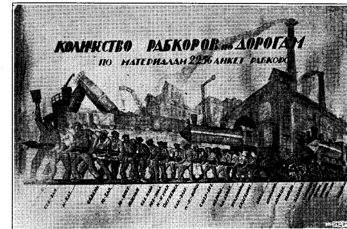
NUMBER OF RABKORS ON THE VARIOUS RUSSIAN RAILWAYS

covered with the network of committees, which bring the paper to the masses most effectively. The convention elaborated plans for the still further extension of the "Rabkor" system in all its ramifications and to make the Gudok more than ever the real mirror of the aspirations and experiences of the railroad workers. Elaborate charts were presented the convention showing the rapid development of the Gudok and the "Rabkor" system which is its foundation. By the end of 1924 there were 5870 intermittent and 4423 regular correspondents. The most careful analyses are made of the make-up of these correspondents from the standpoint of age, sex, occupation, Party membership, etc.