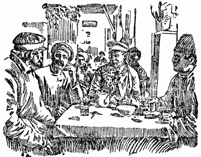
RAILROADERS' DINING-ROOM ON RUSSIAN-URALS LINE 1,000 Fed Daily at Low Cost—Papers, Books and Chess Supplied.

The paper is thoroughly departmentalized. Ordinarily it has six pages, except once a week when it has a special double page in the Ukrainian language. Each of the pages is devoted to certain specific subjects. It will be well for us to glance at them briefly. The first page is devoted to news of the general social and political life of Russia and the world at large. The items are brief and to the point. The yellow journalism of capitalist papers finds absolutely no place in the Gudok . Page two is devoted to special articles on the general political situation, economic life, and Party affairs. This might be called the intellectual page of the paper, using the term intellectual in a