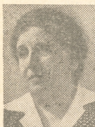
ELIZABETH GURLEY FLYNN For Representative- At-Large