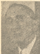
ISRAEL AMTER For Governor